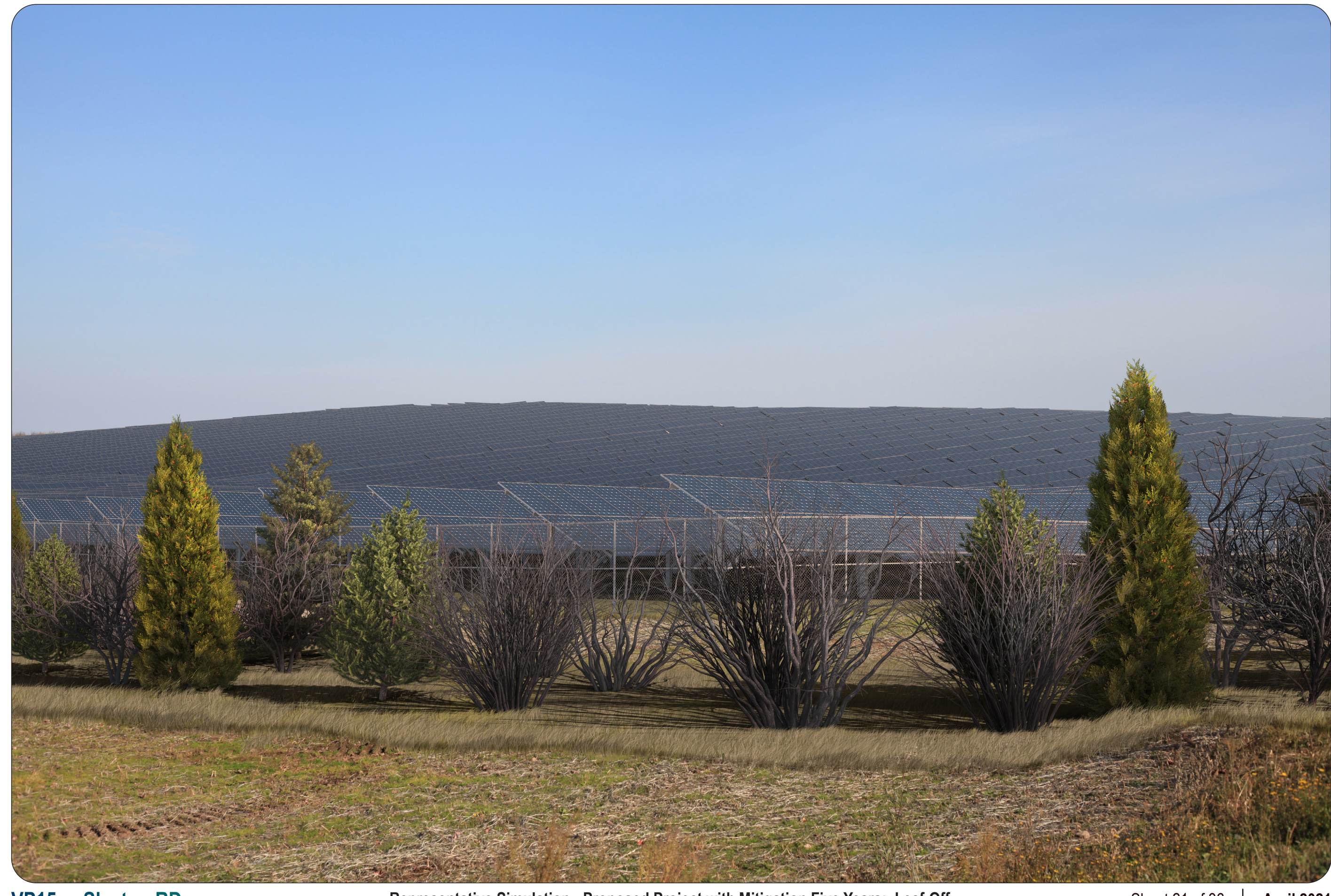
VP15a - Slayton RD