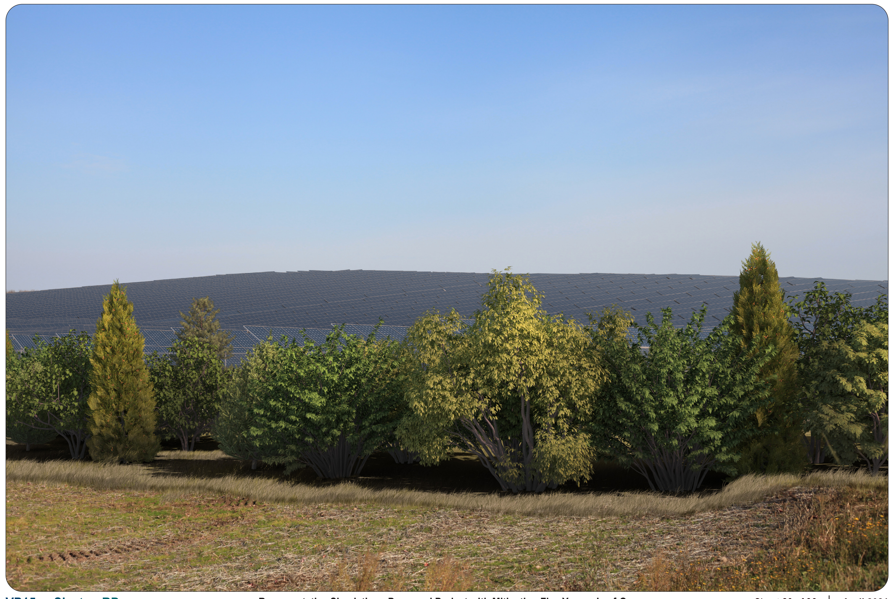
VP15a - Slayton RD