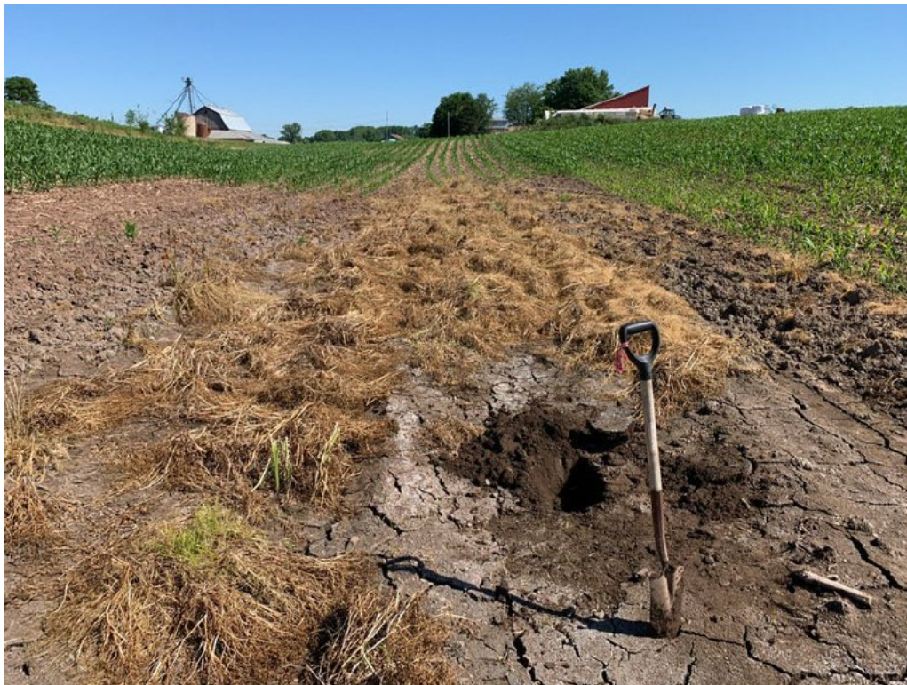
Photo 26. PEM wetland, W-BTF-5, in the western section of the Project Area. 6/17/20.