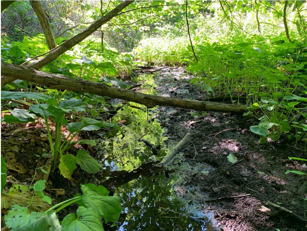
Photo 3. Intermittent stream S-BTF-3 in the western section of the Project Area. 6/16/20.