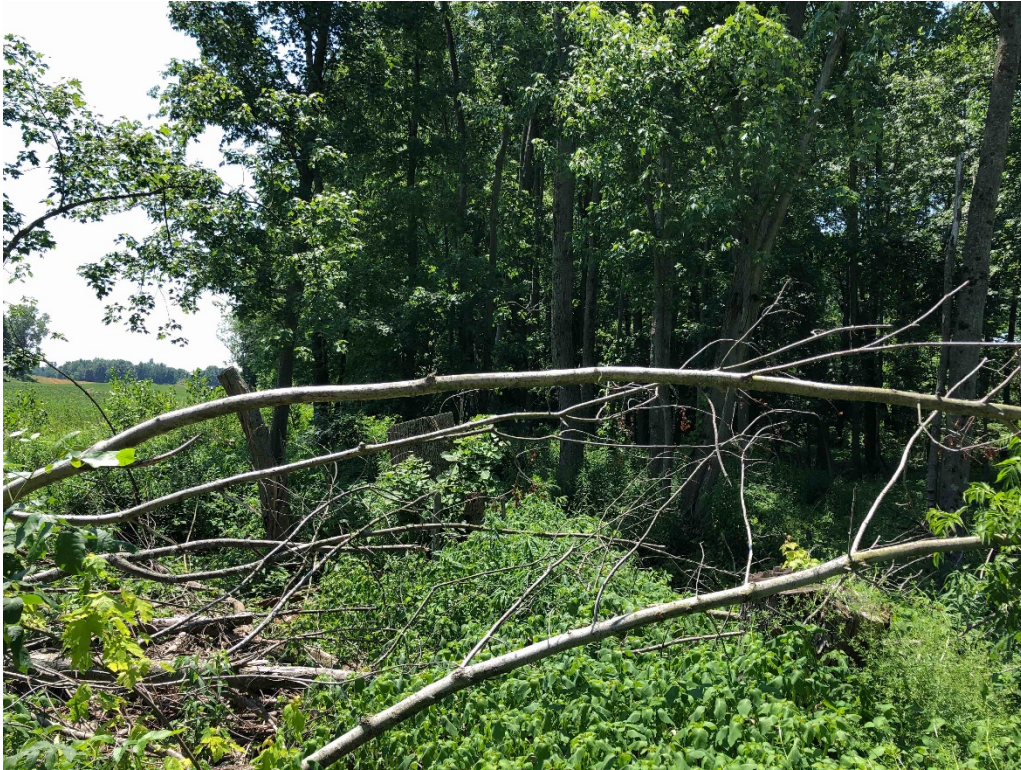
Photo 45. Palustrine scrub-shrub (PSS) wetland, W-JJB-3, in the central section of the Project Area. 6/22/20.