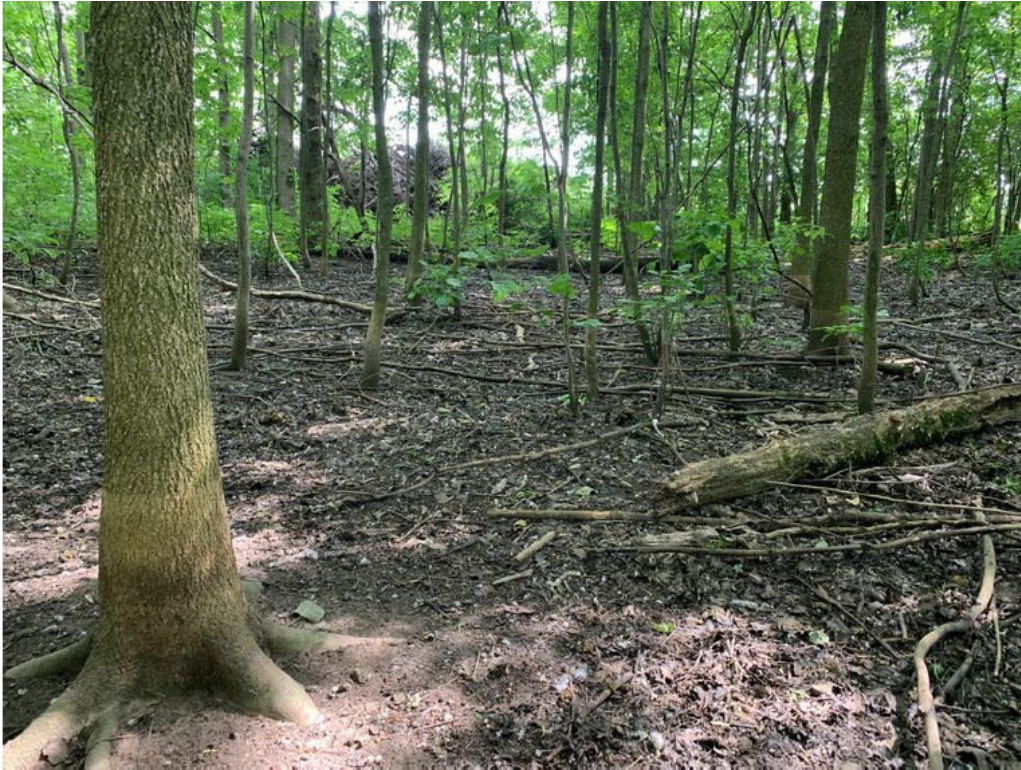
Photo 37. PFO wetland, W-BTF-15, in the western section of the Project Area. 6/18/20.