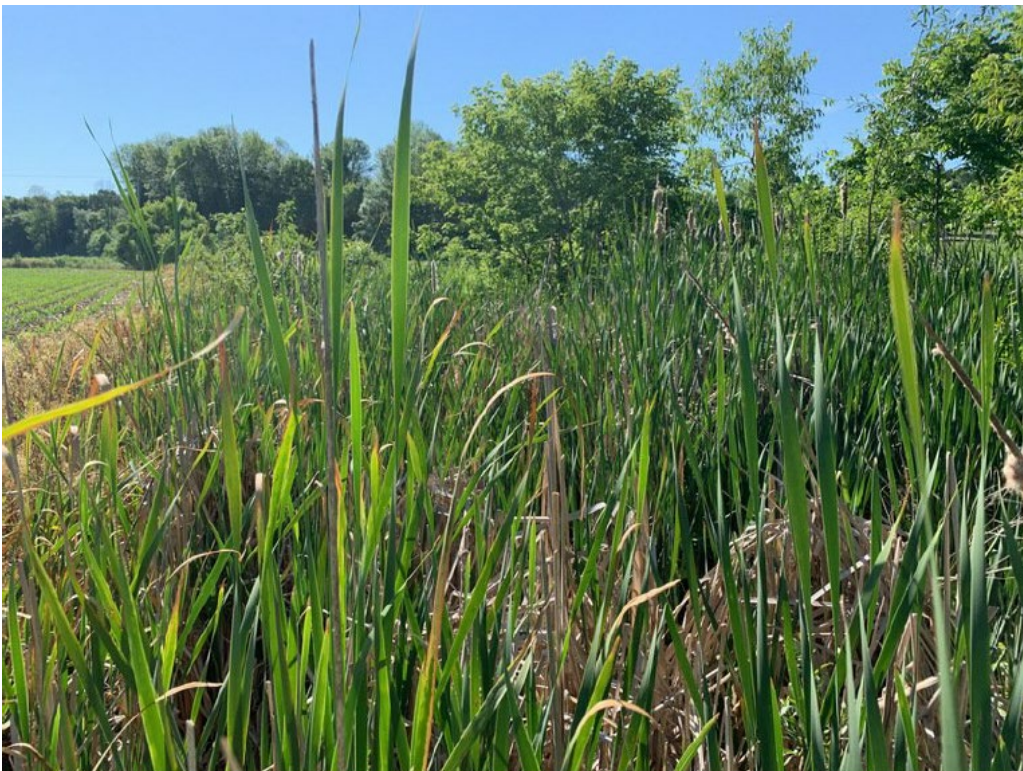
Photo 32. PEM wetland, W-BTF-10, in the western section of the Project Area. 6/18/20.