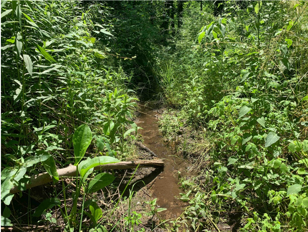
Photo 11. Intermittent stream S-BTF-11 in the central section of the Project Area. 6/22/20.