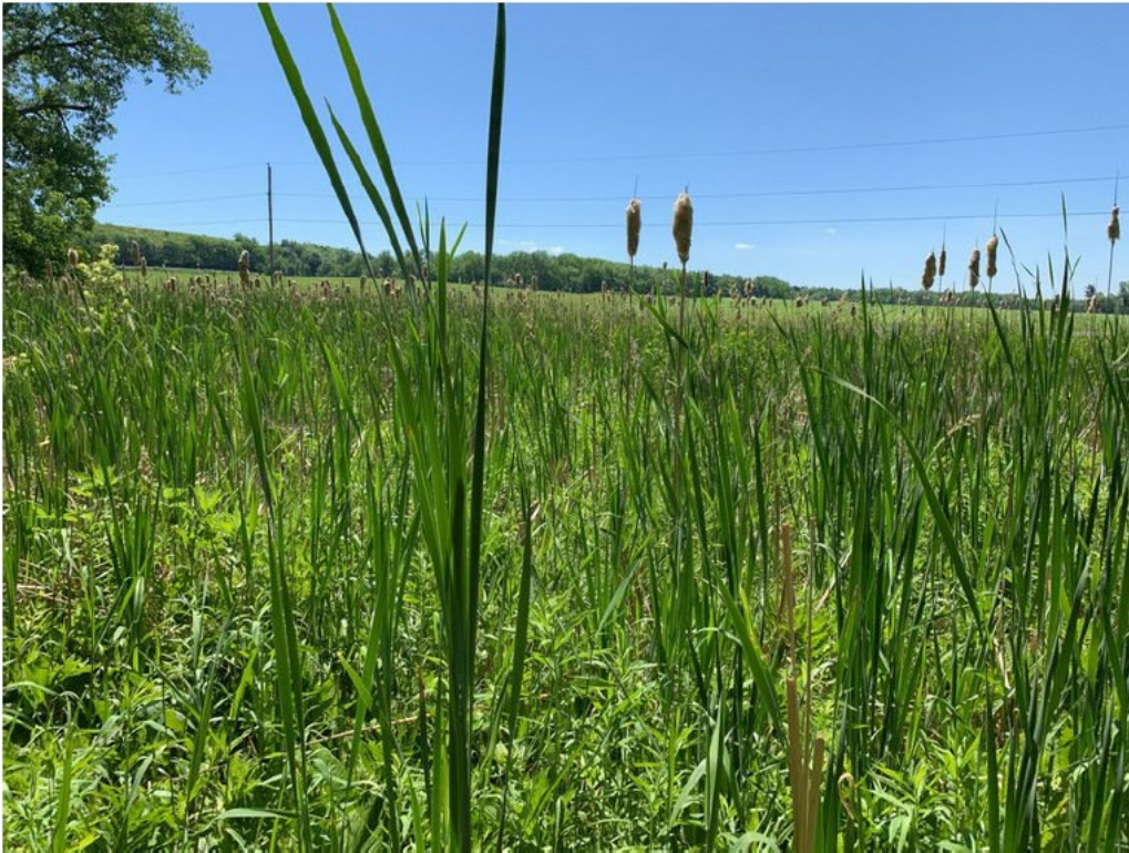
Photo 29. PEM wetland, W-BTF-7, in the western section of the Project Area. 6/17/20.