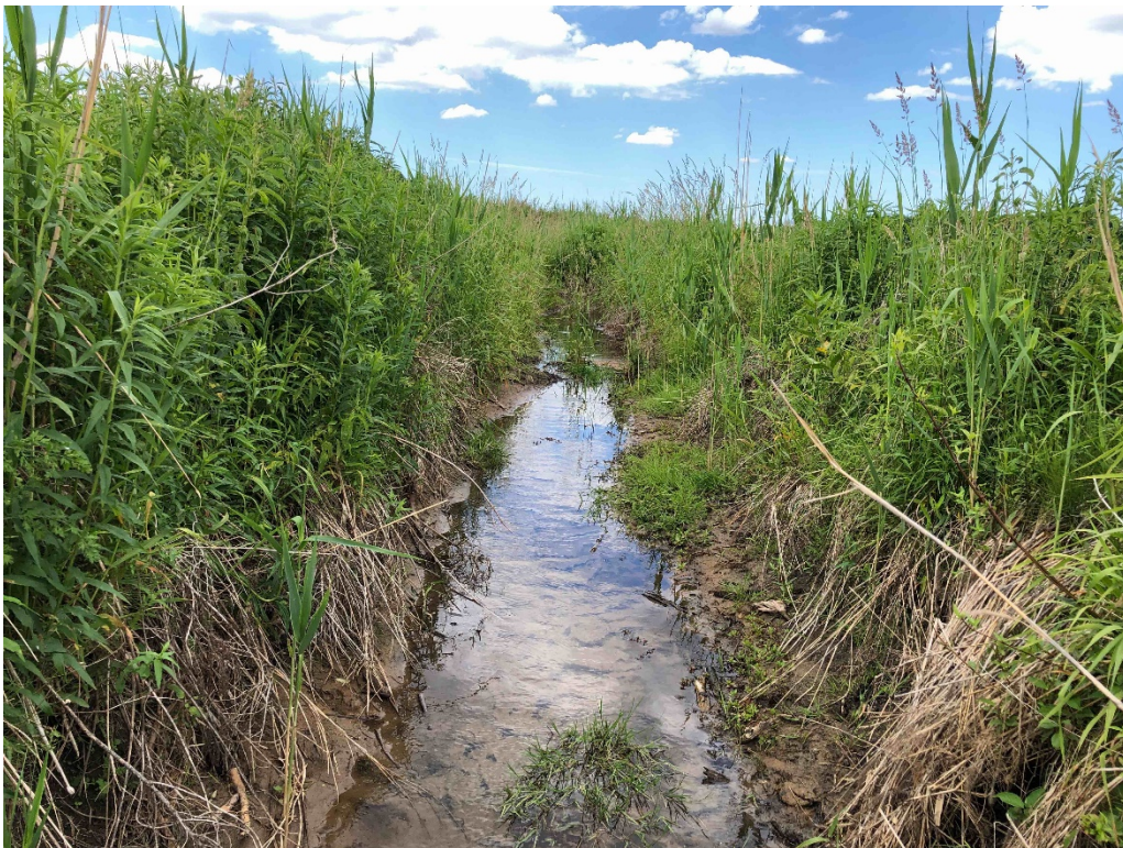
Photo 16. Intermittent stream S-NSD-5 in the southern section of the Project Area. 6/18/20.