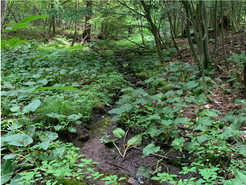
Photo 9. Intermittent stream S-BTF-9 in the central section of the Project Area. 6/19/20.