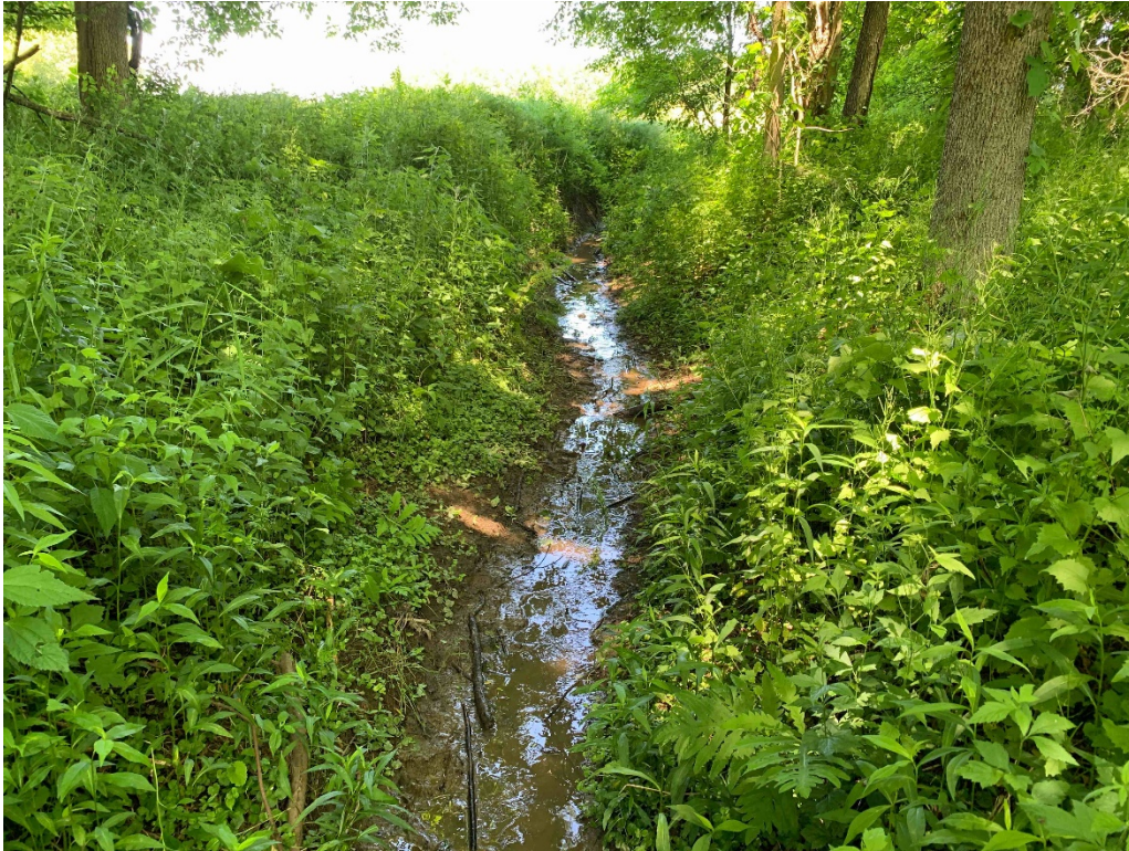
Photo 5. Intermittent stream S-BTF-5 in the western section of the Project Area. 6/17/20.