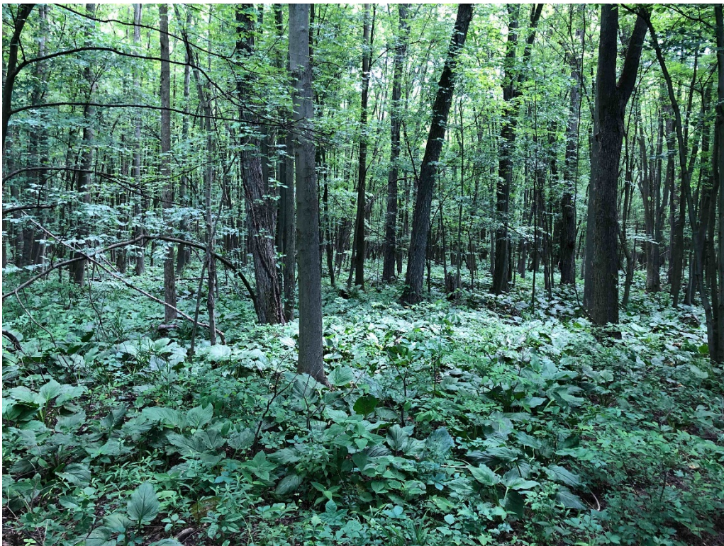
Photo 46. PFO wetland, W-JJB-3, in the central section of the Project Area. 6/22/20.