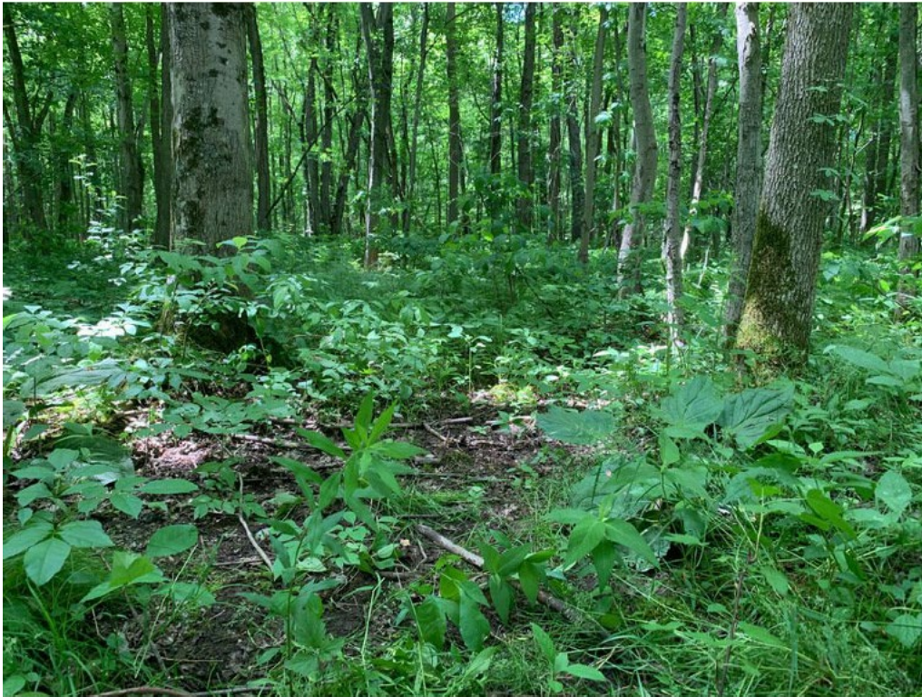
Photo 35. PFO wetland, W-BTF-13, in the western section of the Project Area. 6/18/20.