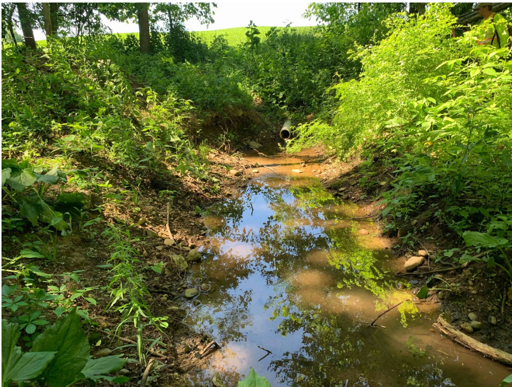
Photo 2. Intermittent stream S-BTF-2 in the western section of the Project Area. 6/16/20.