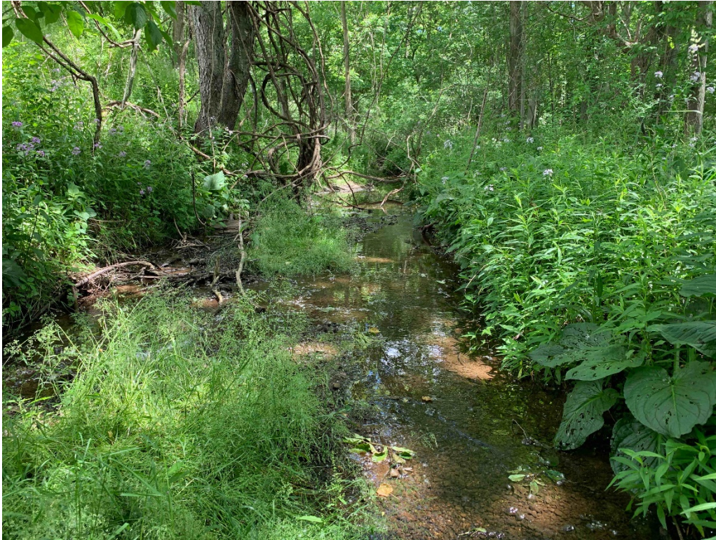
Photo 1. Perennial stream S-BTF-1 in the western section of the Project Area. 6/15/20.