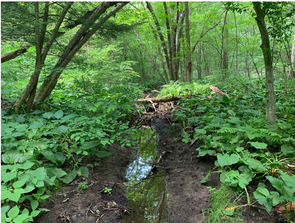
Photo 10. Perennial stream S-BTF-10 in the central section of the Project Area. 6/19/20.