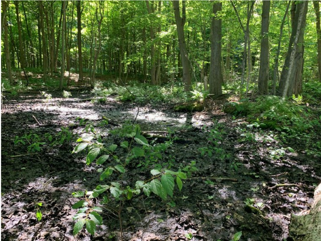
Photo 31. PFO wetland, W-BTF-9, in the western section of the Project Area. 6/18/20.