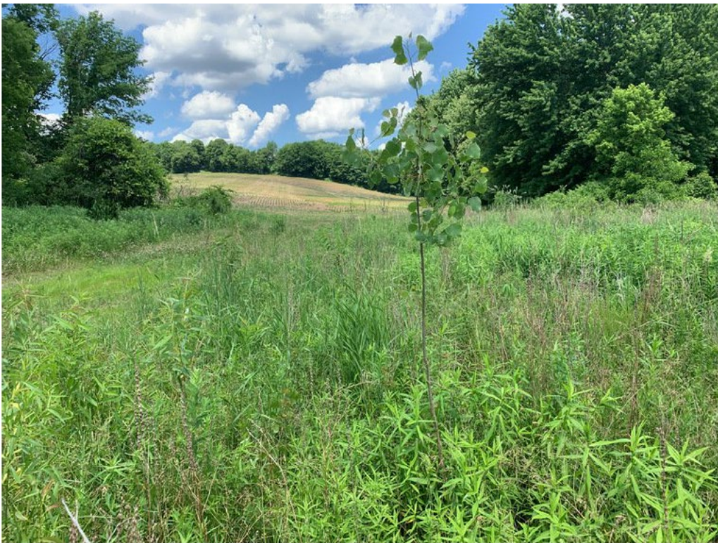
Photo 40. PEM wetland, W-BTF-17, in the central section of the Project Area. 6/19/20.