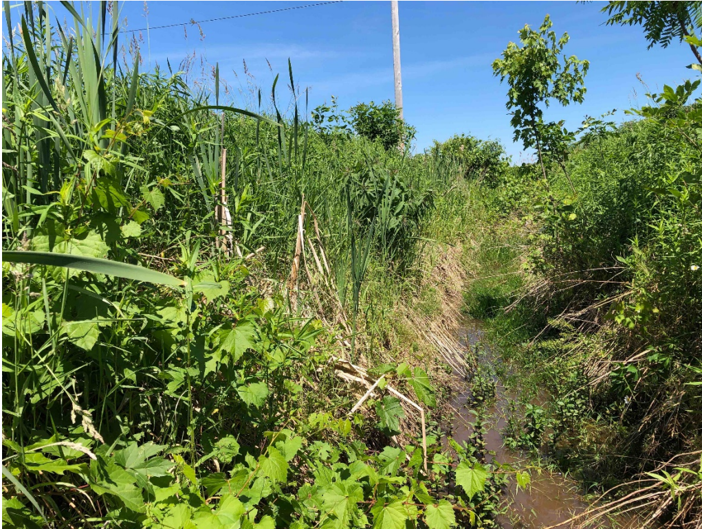
Photo 15. Intermittent stream S-NSD-4 in the central section of the Project Area. 6/18/20.