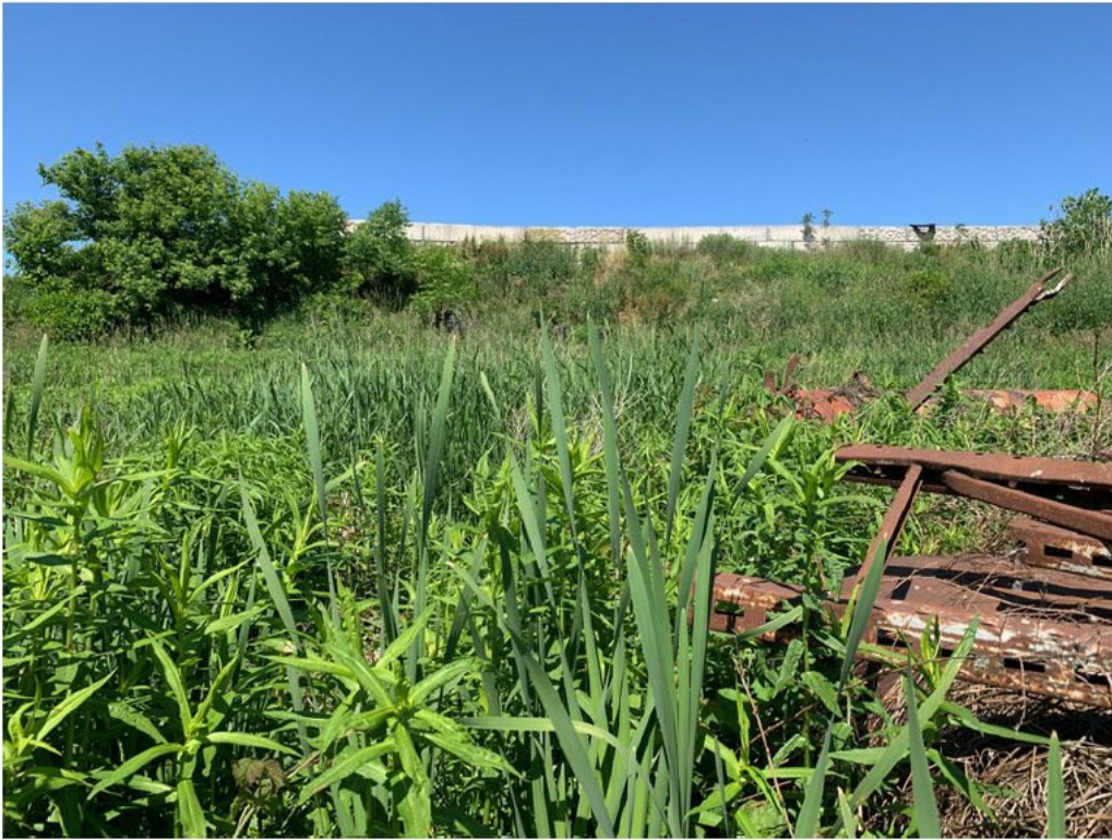
Photo 27. PEM wetland, W-BTF-6, in the western section of the Project Area. 6/17/20.