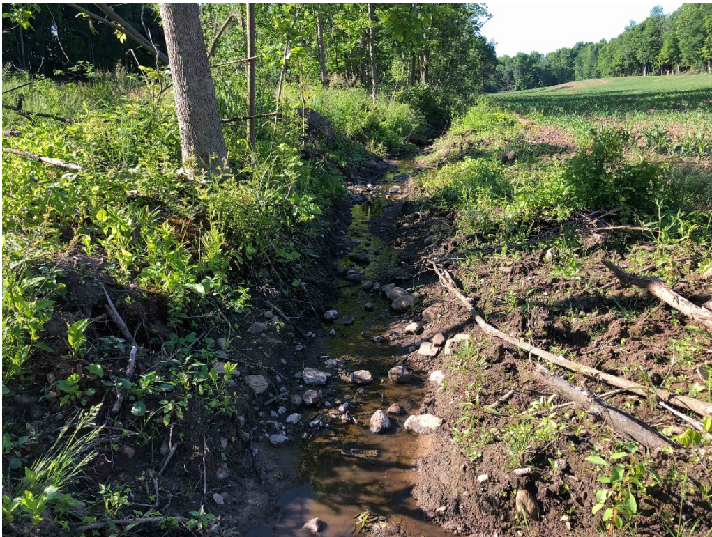
Photo 14. Intermittent stream S-NSD-3 in the southeastern section of the Project Area. 6/18/20.