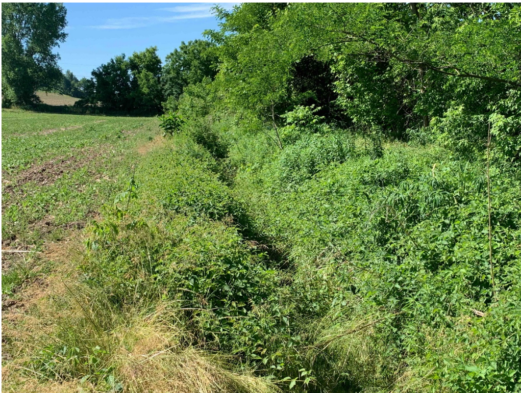
Photo 6. Ephemeral stream S-BTF-6 in the western section of the Project Area. 6/18/20.