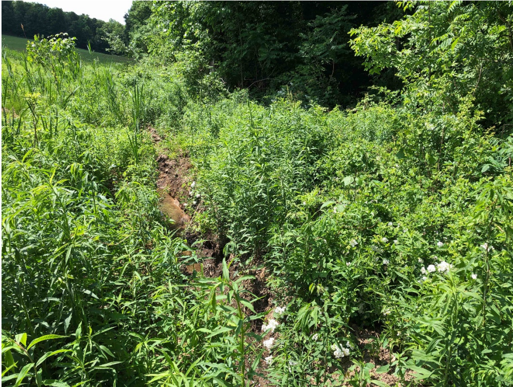
Photo 17. Intermittent stream S-NSD-6 in the southern section of the Project Area. 6/18/20.