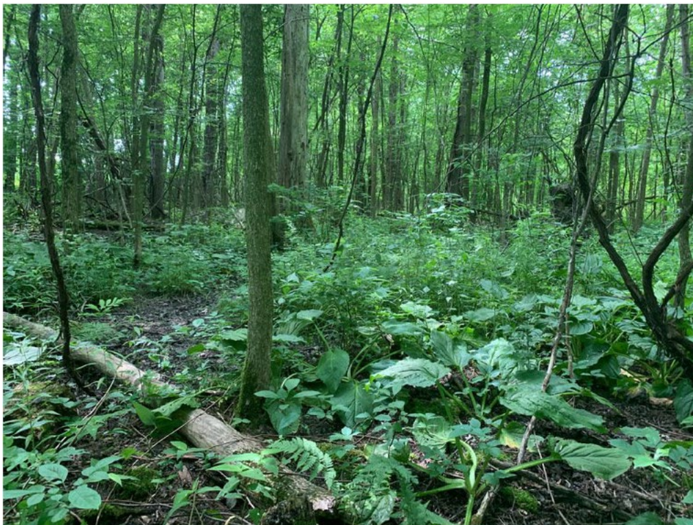
Photo 42. PFO wetland, W-BTF-18, in the central section of the Project Area. 6/22/20.