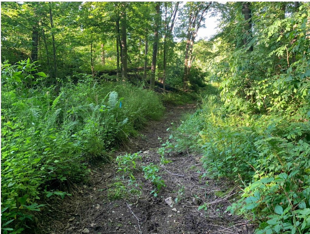
Photo 4. Ephemeral stream S-BTF-4 in the western section of the Project Area. 6/16/20.