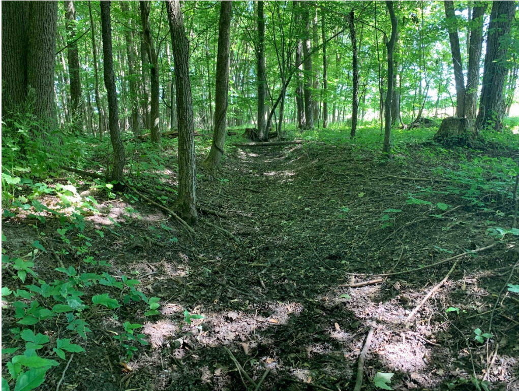
Photo 7. Ephemeral stream S-BTF-7 in the western section of the Project Area. 6/18/20.