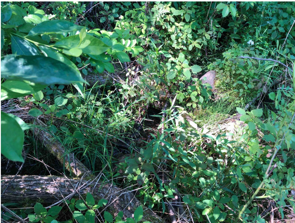
Photo 12. Intermittent stream S-NSD-1 in the southeastern section of the Project Area. 6/17/20.