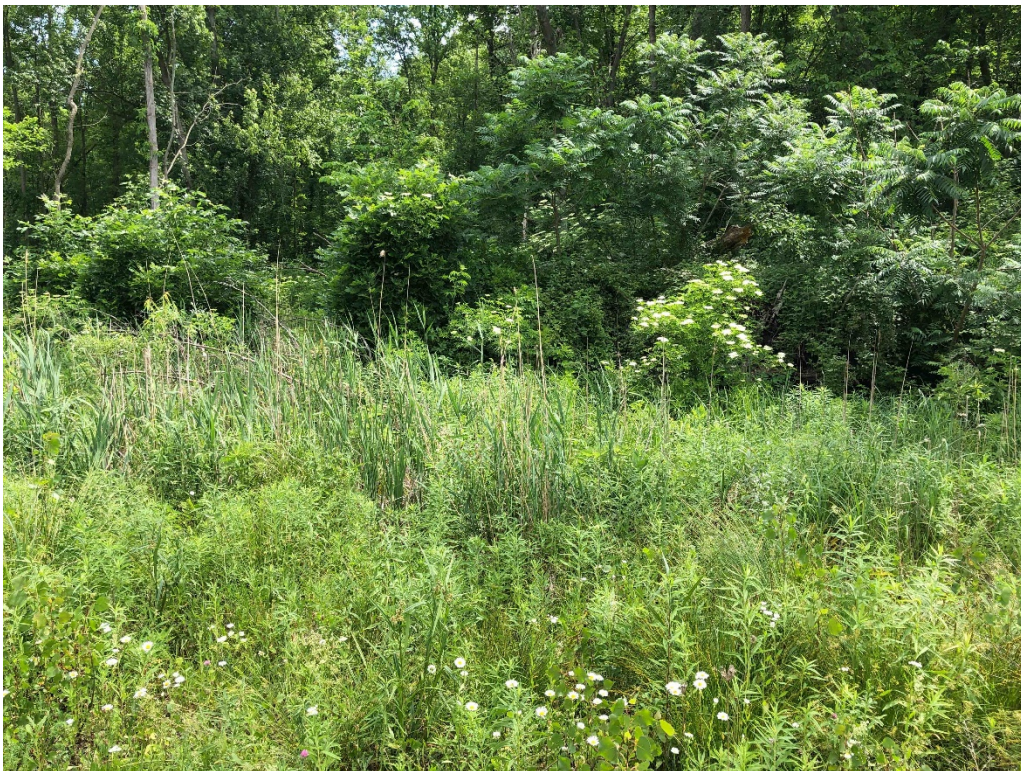
Photo 44. PEM wetland, W-JJB-3, in the central section of the Project Area. 6/22/20.