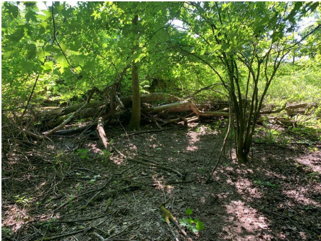
Photo 38. PFO wetland, W-BTF-16, in the central section of the Project Area. 6/19/20.