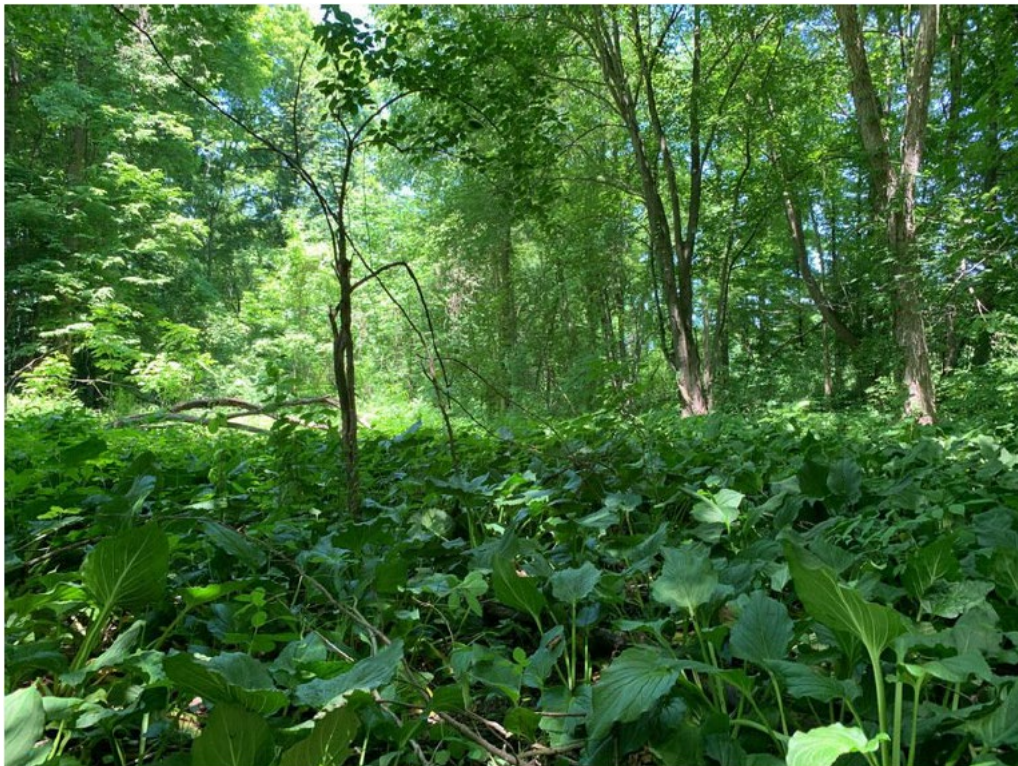
Photo 34. PFO wetland, W-BTF-12, in the western section of the Project Area. 6/18/20.