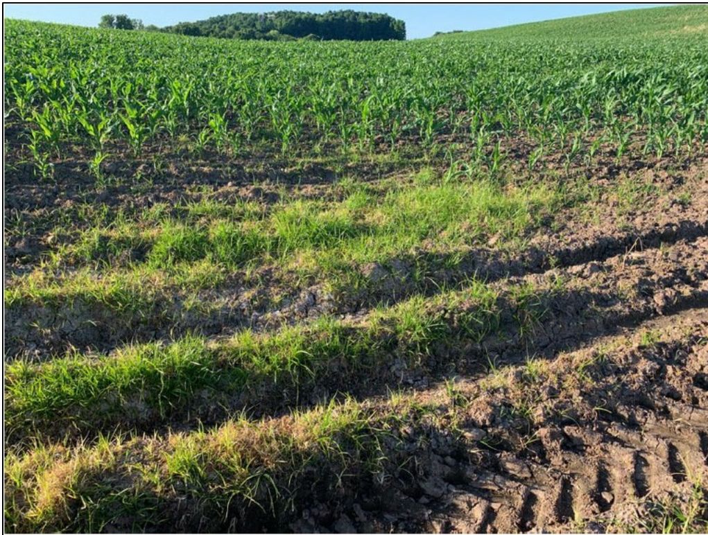
Photo 23. PEM wetland, W-BTF-2, in the western section of the Project Area. 6/16/20.