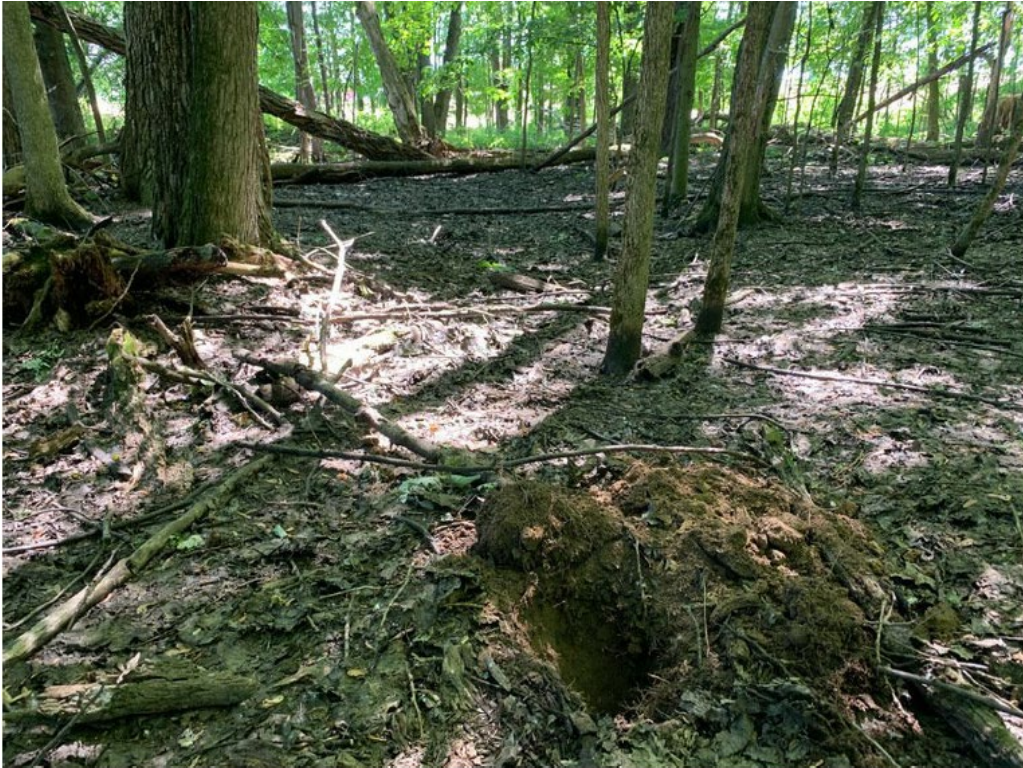
Photo 33. PFO wetland, W-BTF-11, in the western section of the Project Area. 6/18/20.