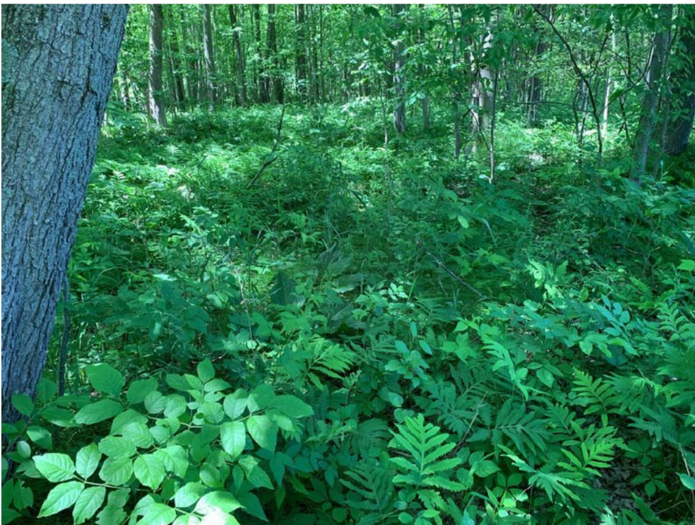
Photo 28. PFO wetland, W-BTF-7, in the western section of the Project Area. 6/17/20.