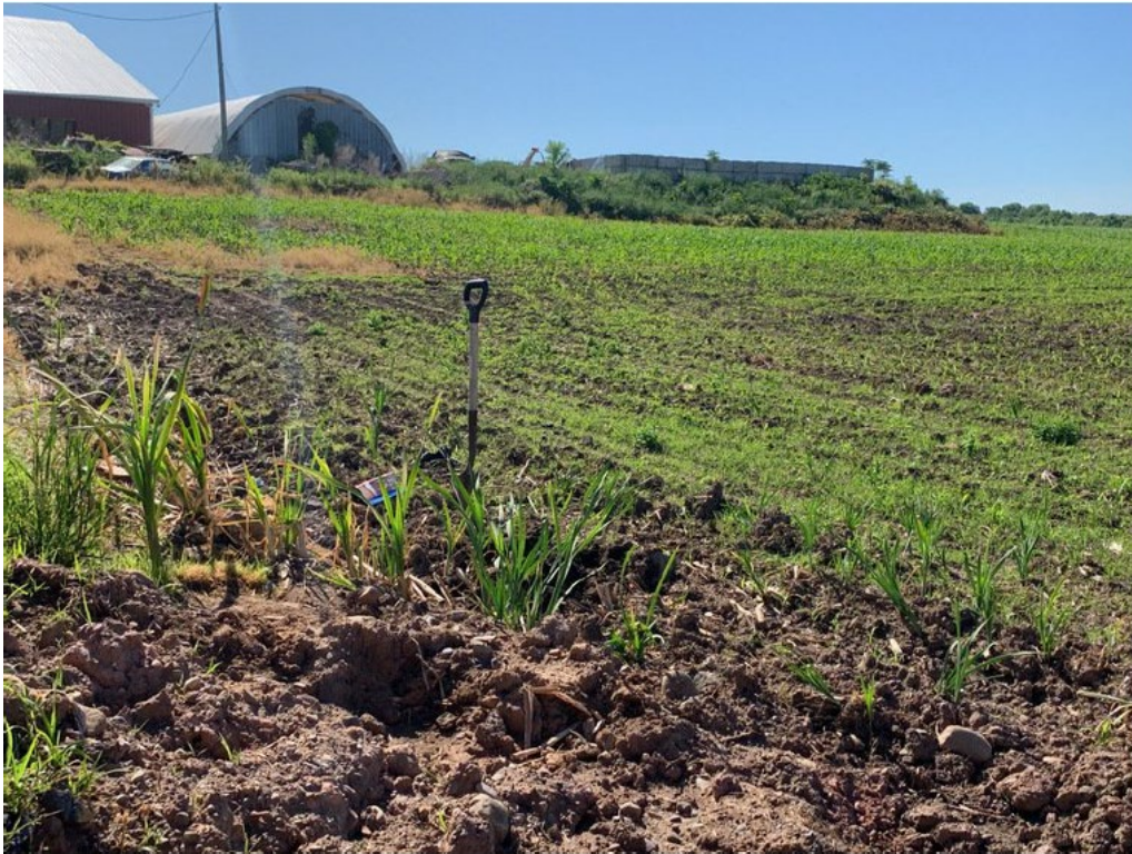
Photo 25. PEM wetland, W-BTF-4, in the western section of the Project Area. 6/17/20.