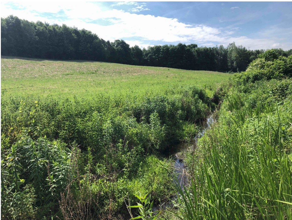
Photo 20. Intermittent stream S-NSD-9 in the central section of the Project Area. 6/23/20.