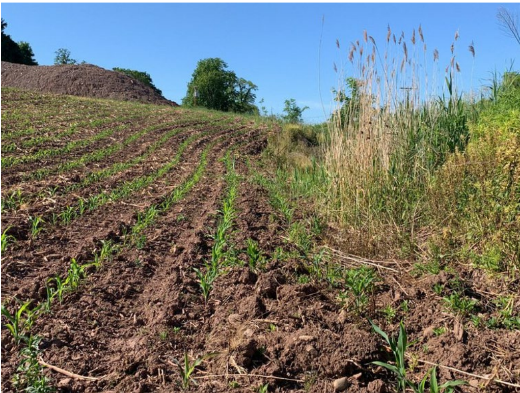
Photo 24. PEM wetland, W-BTF-3, in the western section of the Project Area. 6/17/20.