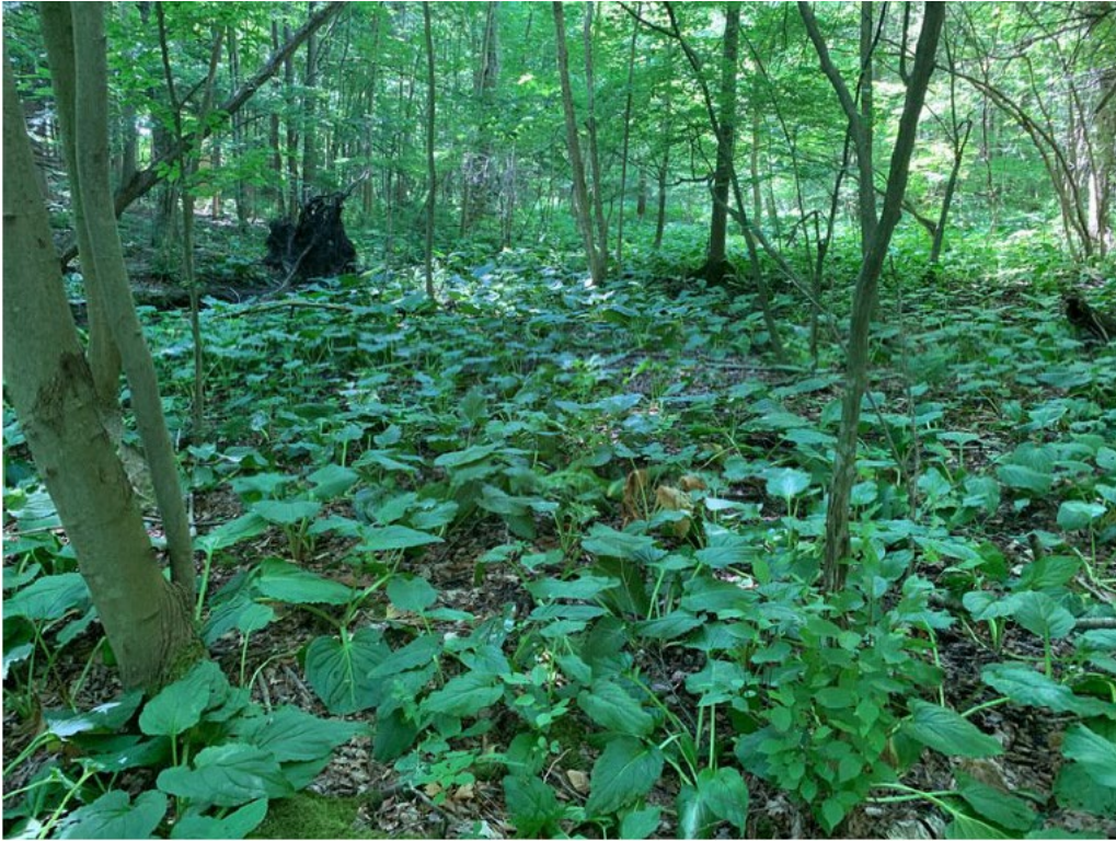
Photo 39. PFO wetland, W-BTF-17, in the central section of the Project Area. 6/19/20.