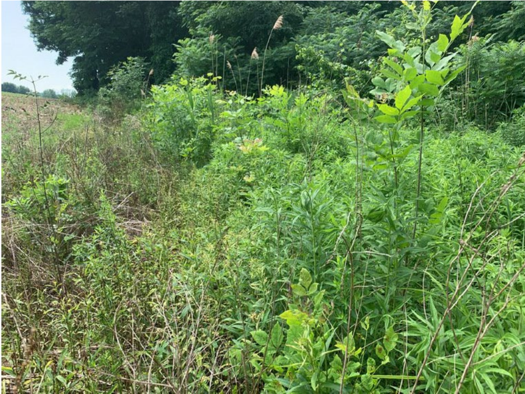
Photo 41. PEM wetland, W-BTF-18, in the central section of the Project Area. 6/22/20.