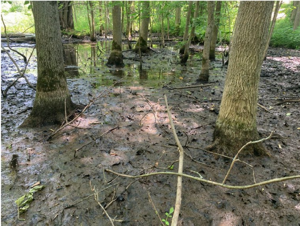
Photo 43. PFO wetland, W-BTF-19, in the central section of the Project Area. 6/22/20.