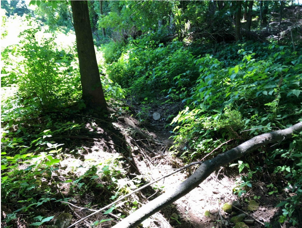
Photo 13. Intermittent stream S-NSD-2 in the southeastern section of the Project Area. 6/17/20.