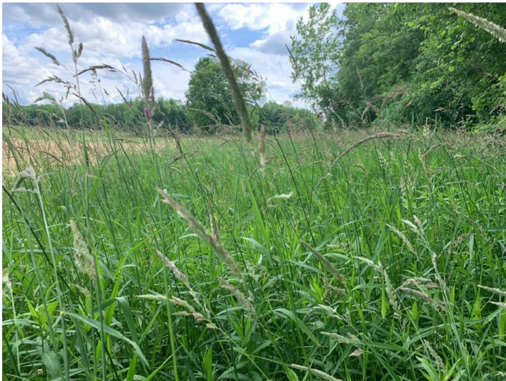
Photo 36. PEM wetland, W-BTF-14, in the western section of the Project Area. 6/18/20.