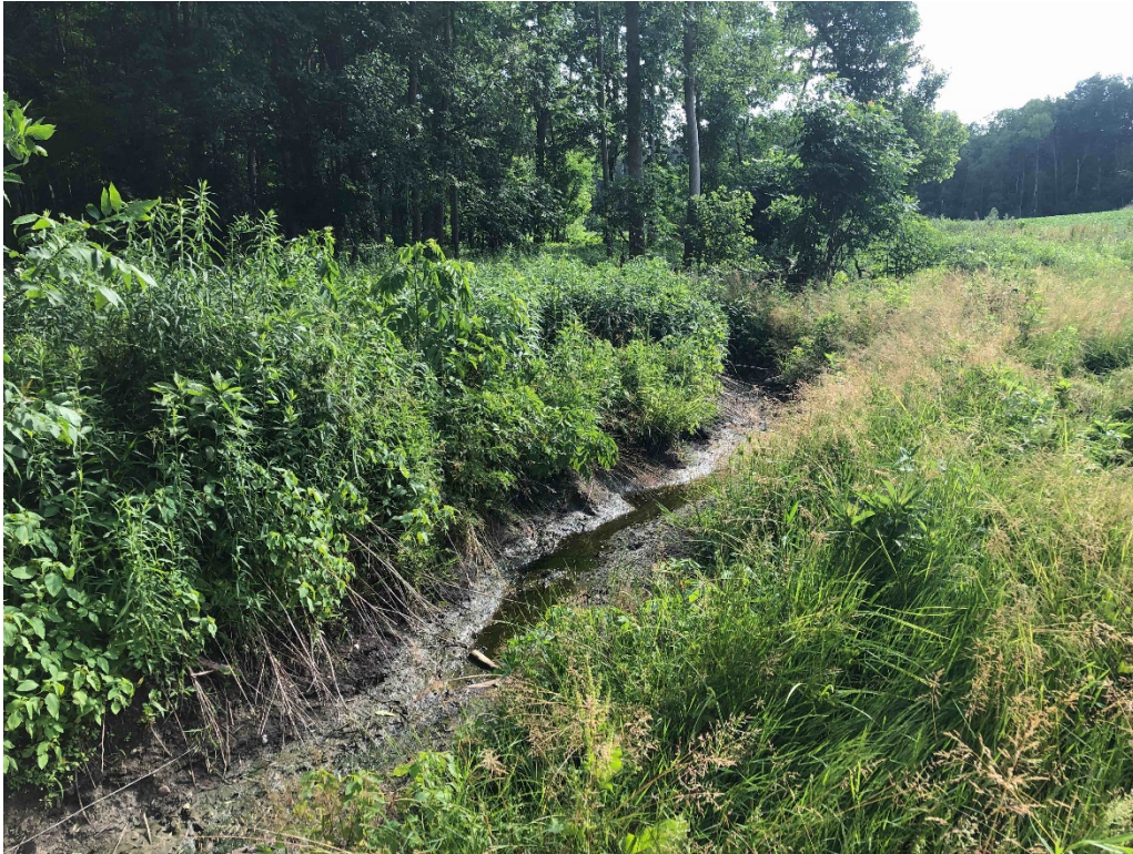
Photo 19. Ephemeral stream S-NSD-8 in the central section of the Project Area. 6/23/20.