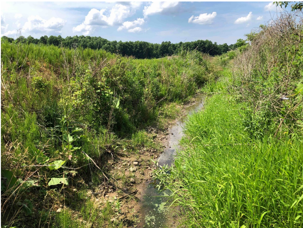
Photo 18. Intermittent stream S-NSD-7 in the central section of the Project Area. 6/22/20.