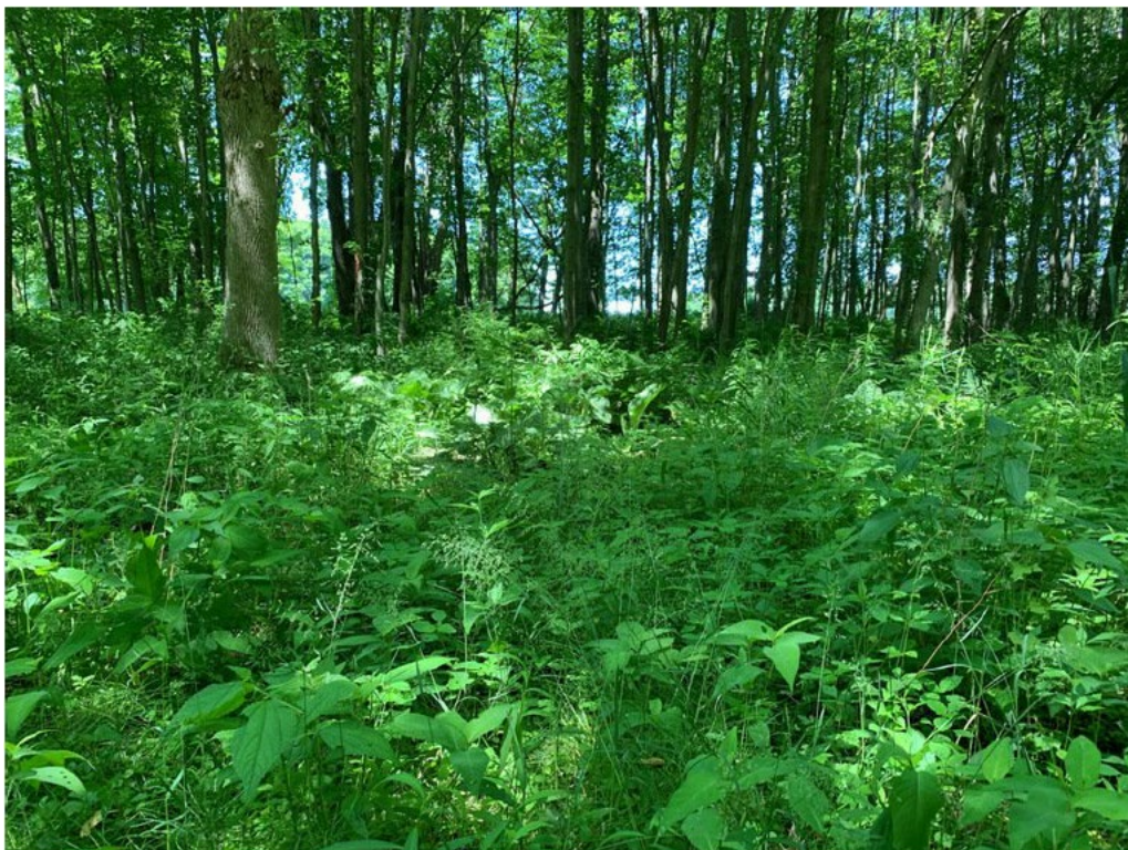
Photo 30. PFO wetland, W-BTF-8, in the western section of the Project Area. 6/17/20.