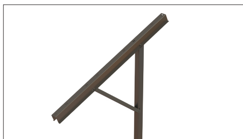
MaxSpan™ FastBuild's rugged beam and brace rapidly attach to pile with just six bolts and nuts - fewest parts in the industry