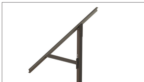
MaxSpan™ WideFlange's telescoping post bracket with up to 5 inches vertical adjustment for fast top of pile leveling