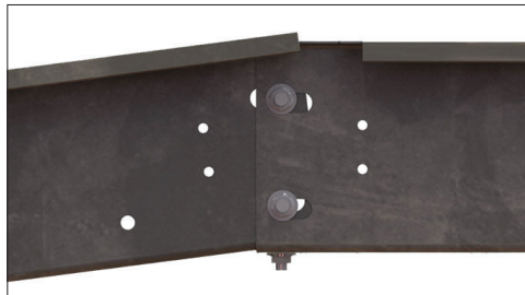
Patent pending articulating purlin connection to navigate sloping terrain